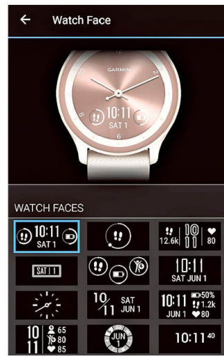
You can customise the watch face using the Garmin Connect app,

hot, humid and crowded space without an AC for a couple of hours!