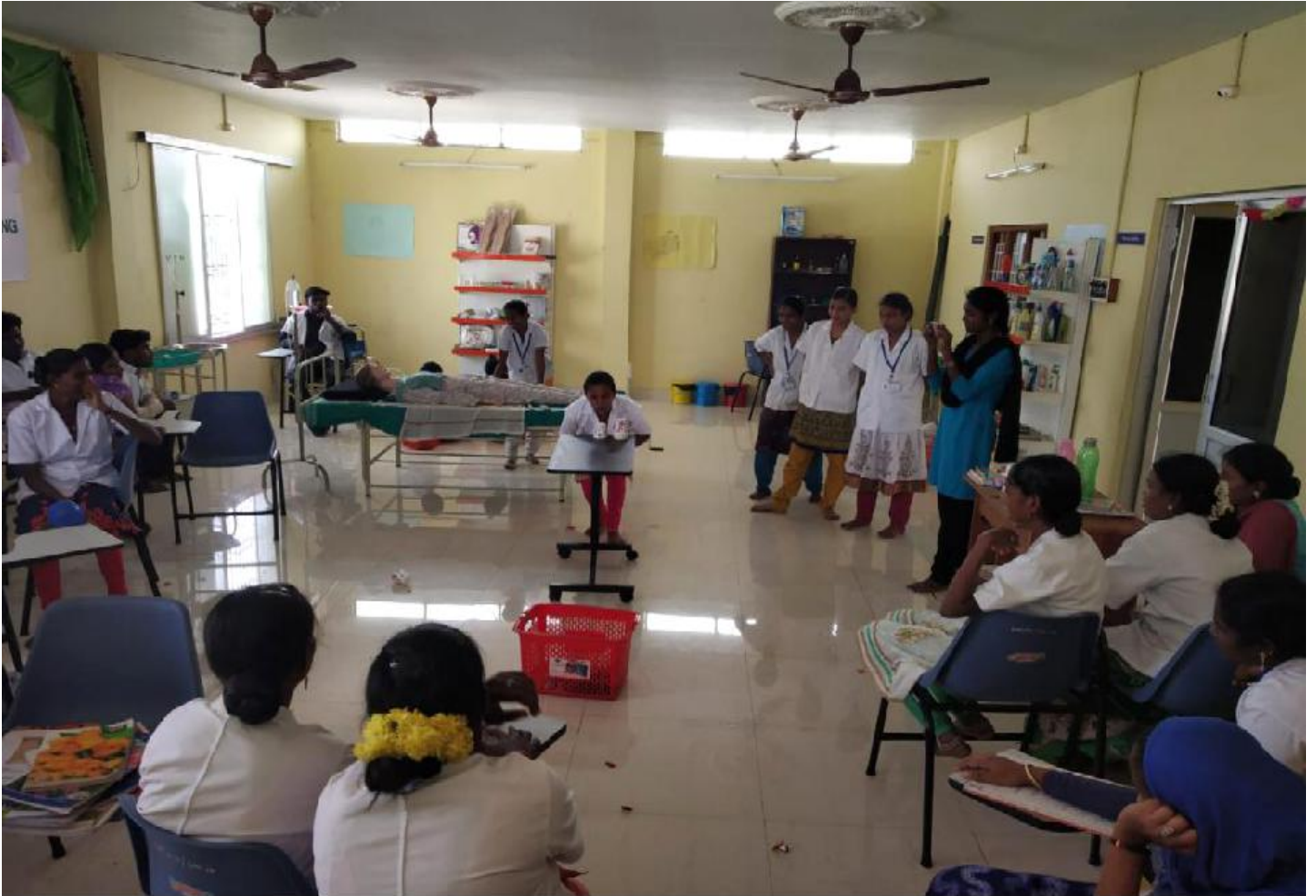
PONGAL CELEBRATION AT SKILL TRAINING CENTRE