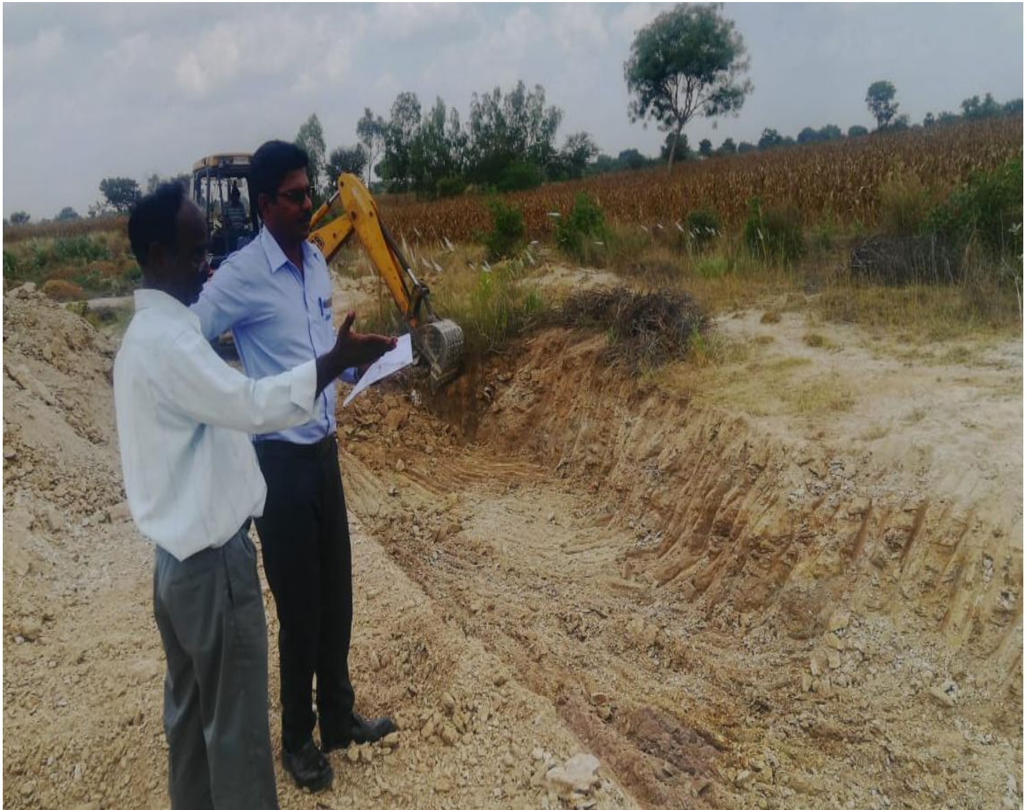
CONSTRUCTION OF SUNKEN POND IN PROGRESS AT MELARASUR WATERSHED VILLAGE