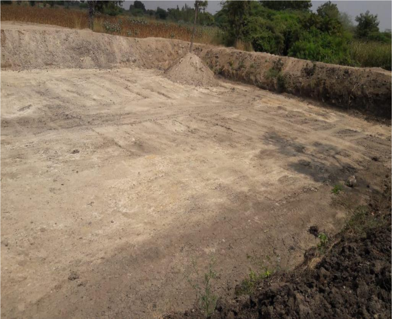
NEW SUNKEN POND AT KOVANDAKURICHI VILLAGE